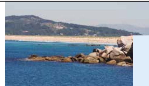
A Lanzada beach

The San Vicente peninsula provides us with the oldest iconographic representation of the translation of the body of the apostle St. James: a coin from the Compostelan diocese corresponding to the reign of Fernando II of León (1157-1188) found in the archaeological excavations of Adro Vello, on O Carreiro beach. The back of the coin, in silver and copper, and which is on exhibit today in Santiago's