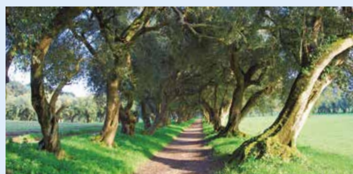
Pazo de Santa Cruz de Ribadulla, Vedra

The ocean awaits us with dozens of beaches de which culminate in the peninsula of O Grove, surrounded by attractive stretches of sand. Joined to land by the beach of A Lanzada, a large sandy area with Roman and Suevian remains and a beautiful XII century hermitage. The peninsula is also connected by a charming bridge of modernist inspiration to the most recognised island, A Toxa, situated in the middle of the Ria de Arousa. This offers us the exclusivity of its hotels, health resorts, thalaso-therapy and spa, and unbeatable sunsets. We can observe the shellfish gatherers and, in the nearby harbour of O Grove, taste exquisite shellfish. If our visit coincides with the first days of October, we will enjoy a very animated and historical Festa do Marisco in O Grove, which has been held since 1963.