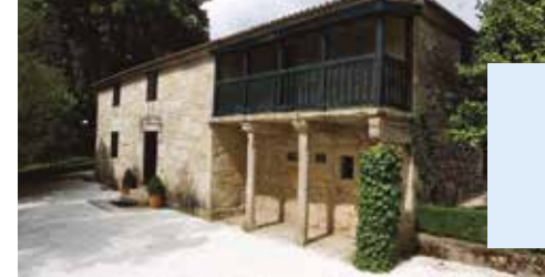
Rosalía de Castro House-Museum

Monumental Padrón presents us with numerous examples of its beauty. But Padrón's scenery is also seductive, inviting us to walk along the banks of the River Sar to its mouth in the River Ulla. There is an 125-step vía crucis , or "Way of the