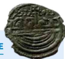
Adro Vello's Coin

Between San Vicente point and the Island of A Toxa, O Grove boasts a coastline with some magnificent white and golden sandy beaches, authentic gifts of nature with wild pine forests and interesting trekking routes, as well as a varied gastronomy, with seafood as the star attraction.