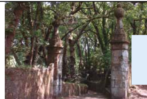
Pazo do Faramello

In the parish of Ribasar, we come across an important archaeological site, Castro Lupario , on a hill shared with the municipality of Brión. Here, we can see the remains of