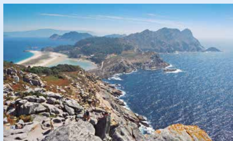
Ilhas Cies. Parque Nacional das Ilhas Atlánticas

The ocean awaits us with dozens of beaches de which culminate in the peninsula of O Grove, surrounded by attractive stretches of sand. Joined to land by the beach of A Lanzada, a large sandy area with Roman and Suevian remains and a beautiful XII century hermitage. The peninsula is also connected by a charming bridge of modernist inspiration to the most recognised island, A Toxa, situated in the middle of the Ria de Arousa. This offers us the exclusivity of its hotels, health resorts, thalaso-therapy and spa, and unbeatable sunsets. We can observe the shellfish gatherers and, in the nearby harbour of O Grove, taste exquisite shellfish. If our visit coincides with the first days of October, we will enjoy a very animated and historical Festa do Marisco in O Grove, which has been held since 1963.