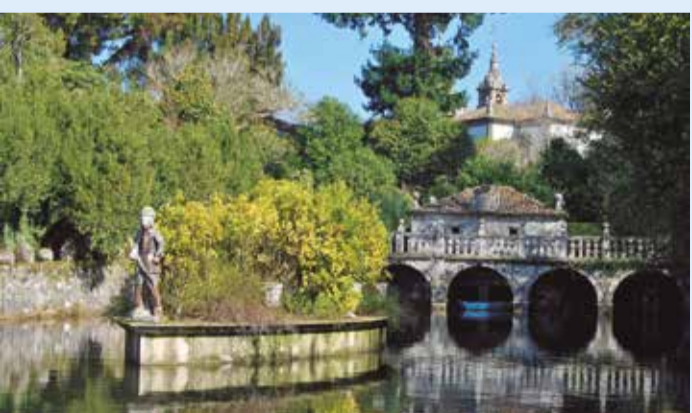
Pazo de Oca, A Estrada

From a gastronomic route to what is both a monumental and a botanic route: the Ruta da Camelia, a winter flower originating in China and Japan but found an excellent home in the aristocratic gardens of the pazos (mansions) of Galicia: The Pazo de Rubiáns, in Vilagarcía de Arousa; the aforementioned Pazo de Bazán, in Cambados; the Pazo de Oca, in A Estrada (known as the "Versailles of Galicia"); or the Pazo de Santa Cruz de Ribadulla (in Vedra, with giant camelias – four magnificent ones –, among others).