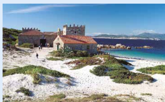
Illa de Sálvora. Parque Nacional das Ilhas Atlánticas

The islands which compose the Parque Nacional das Ilhas Atlánticas emerge on the Atlantic horizon. From south to north: Cies, Ons, Sálvora and Cortegada. All of them can be visited. Their nature is unique and their beaches and woods are extraordinary. The bosque de laurel de Cortegada (Laurel Wood of Cortegada) (opposite Carril) is the largest in Europe and the beach of Rodas, in the Cies, is considered to be one of the best in the world. In Sálvora there are deer and wild horses (due to the historical use of the island as a private game reserve), and in Ons, octopus is prepared and tasted in ways which are unique.