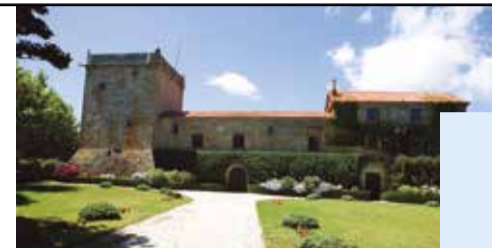
Tower of Xunqueiras

The municipality is the result of the merging of two nuclei in the 19 th century: A Pobra do Deán and the town of O Caramiñal. At the time, the local processing industry, in the hands of Catalanian industrialists, was at its most successful.