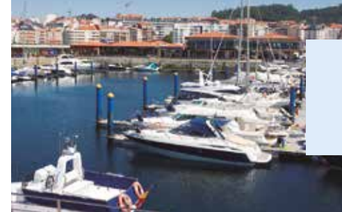
Port and marina

Where the beach starts, on the Sanxenxo side, A Lanzada boasts historical late-Roman and medieval architecture, made up of a Roman necropolis, excavated in 2010, a watchtower, known as the "Viking tower", and a 13 th -century Romanesque chapel.