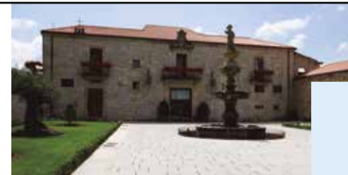
Pazo de Lestrove

This area has a rich noble past: the pazos of Lestrove and Hermida pay unique testimony to this. It also has a grand literary and cultural tradition, born of its intimate connection with Rosalía de Castro and her husband Manuel Gurguía, who spent several spells here. Also, and dotted across the whole of the municipality, we can find beautiful examples