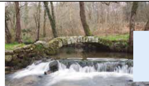
Rúa de Francos bridge

Passing through Teo, the River Ulla leaves us memorable landscapes and areas particularly suited to fishing. As with many other municipalities in the region, Teo stands out for its valuable ethnography, with its petos de animas , or shrines to souls, dotted throughout the area and its cruceiros , or stone crosses, including the one in Francos, one of the oldest in Galicia.