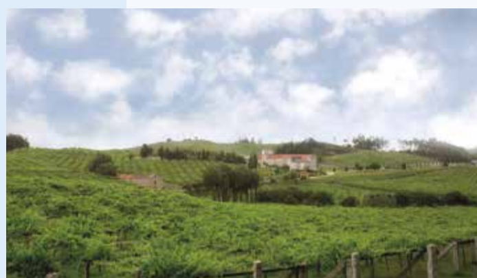
Vineyards of the Rias Baixas Designation of Origin

You have reached Compostela. Put away your pilgrimage boots and become a traveller, curious, sensitive and active. Go back over your journey. All that you were not able to see or enjoy on your route awaits you. Similarly seductive ways open up before you. Take a look at the suggestions we have prepared for you.