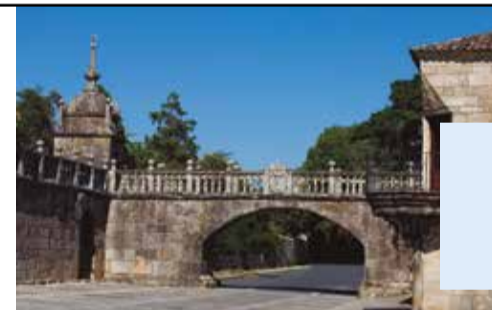
Pazo de Fefiñáns

The country houses or stately homes, mainly from the 17 th and 18 th centuries, are all admirable, such as the above-mentioned Pazo de Bazán, the Pazo de Ulloa or the Pazo