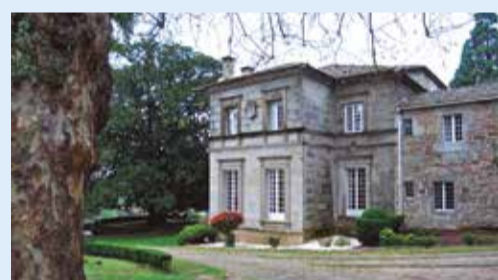
Pazo de Rubiáns, Vilagarcía de Arousa

Very near Cambados is the XII century Monastery of Santa María de Armenteira, considered to be the cathedral of O Salnés. Precisely along the River Armenteira runs a magnificent 14 kilometre (there and back) trekking pathway called the "Ruta da pedra e da auga": river landscapes, genuine mills, riverside woodland, etc. in a captivating environments. Other routes such as those of the Molinos del Río Chanca, also transport us to the most fluvial and typical nature area in Galicia.