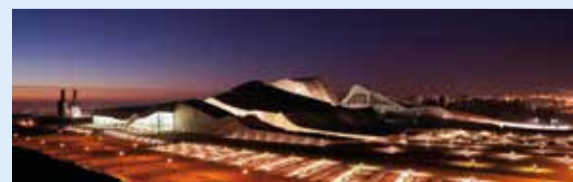
Cidade da Cultura, Santiago de Compostela

The new walks by the river Sar – to the east of the city (in the zone known as As Brañas do Sar) – open up before us and culminate with the ascent, along paths, through the new Bosque de Galicia and the Parque do Lago of the Gaiás. This new 24 hectare area grows on the slopes of Monte Gaiás, which presides over the Cidade da Cultura.