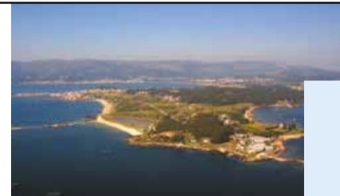
O Chazo point

Indeed, the castro of Neixón, overlooking the sea via the inlet of Rianxo, allows us to travel back in time 2000 years and