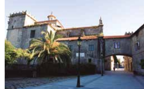
Santa Rita convent

From its lively port area departs a promenade which runs for more than two kilometres, linking the centre to the village of Caril, parallel to the beaches of A Concha and Compostela. Caril is famous for the quality and preparation of its most famous seafood: clams. Facing this fishing town, scarcely 200 metres from the coast, lies the Island of Cortegada, which forms a part of the Atlantic Islands of Galicia National Park. Here, we