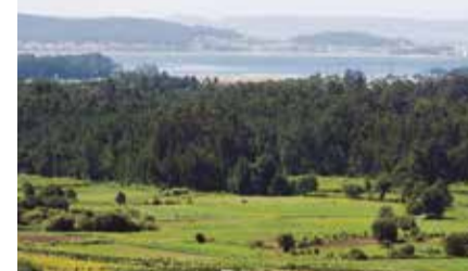
Views from Meaño

With a population of some 6000, Meaño shows its impressive civil architecture and ethnography in the form of cruceiros (stone crosses), hórreos (raised granaries) – such as the one in Simes, in the shape of an "L" –, water mills – indeed, there are more than 70 throughout the region –, or pazos (country houses) such as Zárate or Lis, as well as the Romanesque chapels, among which the church in Simes stands out.