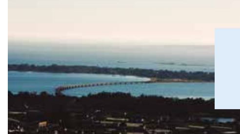
Island of Arousa